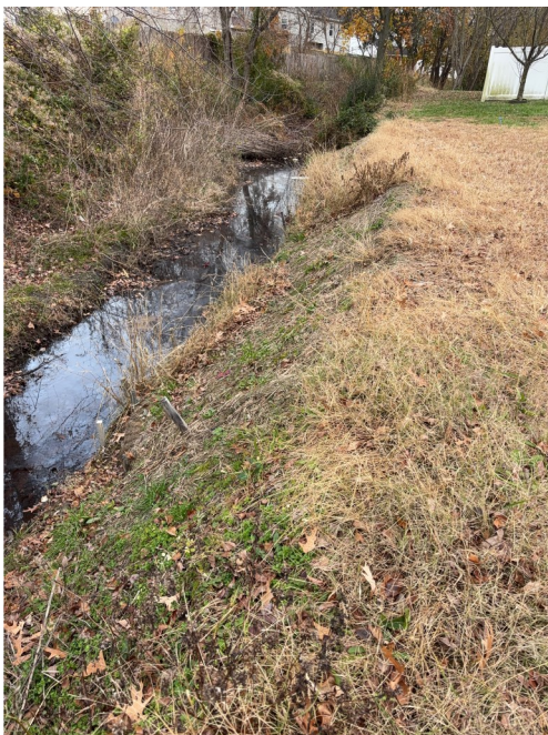
Main Channel at Anchor Ln (Bay Tree) where Coir Logs were added in Summer 2025