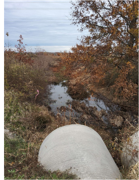
Main Channel at Garrison Oak Technical Park

In the future, the Semi Annual Inspections for these segments will be scheduled before the beginning of Leaf Pickup Season.