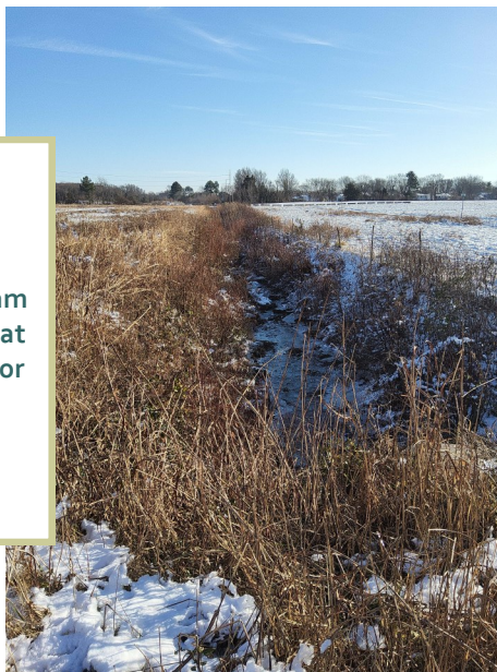
Main Channel Downstream of Prong 3 at Dover Motor Speedway