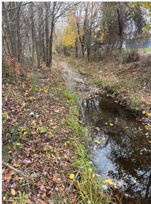
Prong 1 in front of Bay Tree